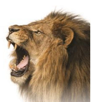
The Lord comes with a "roar," a "shout," with a "sharp sword" out of His mouth which destroys the Anti-Christ's army (Isa. 42:13; Jer. 25:30; Joel 3:16; Rev. 19:15).

The rapture and the second coming of Christ are often confused. Sometimes it is difficult to determine whether a scripture verse is referring to the rapture or the second coming. However, in studying end-times Bible prophecy, it is very important to differentiate between the two.